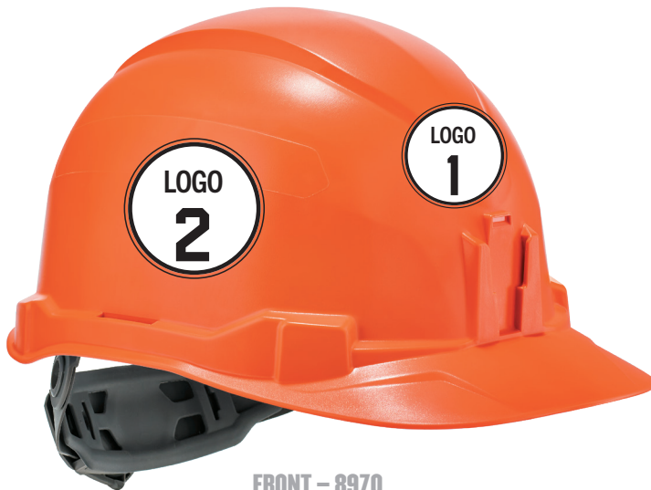
FRONT – 8970

Pad print or sticker your logo to location 1 (front), and/or location 2 (sides) and/or location 3 (back).