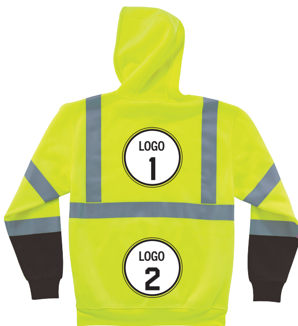
BACK - 8293