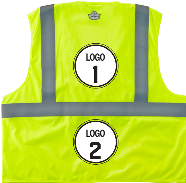
BACK - 8255HL

Digital heat transfer your logo to locations 1 and/or 2 (back) and/or locations 3, 4, 5 and 6 (front).