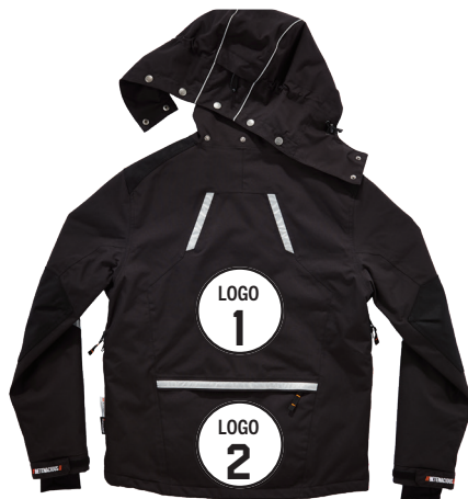
BACK - 6466