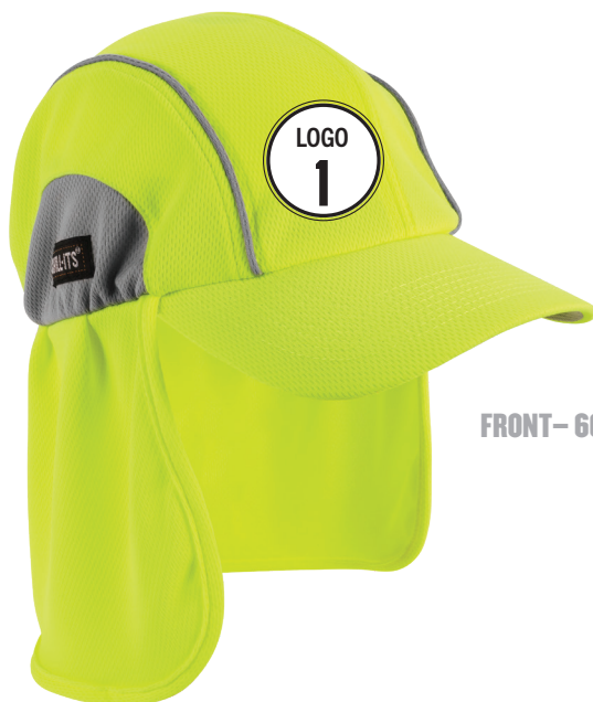
FRONT - 6650

Digital heat transfer or embroider your logo to location 1 (front) and/or digital heat transfer your logo to location 2 (neck shade).