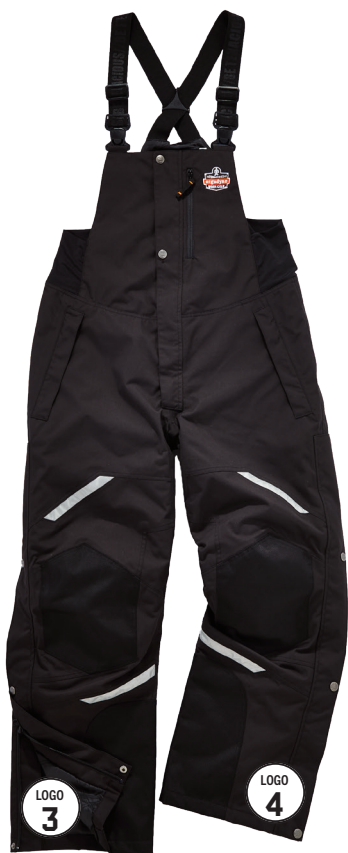
FRONT - 6471