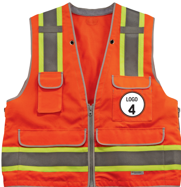
FRONT - 8254