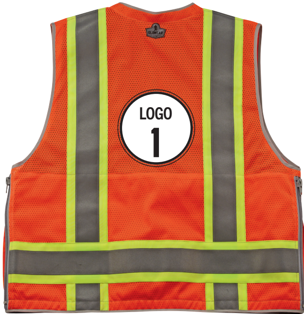
BACK - 8254

Digital heat transfer your logo to location 1 (back) and/or location 4 (front pocket).