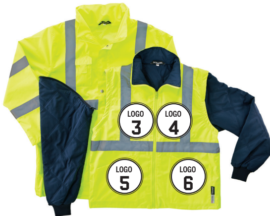
FRONT - 8385