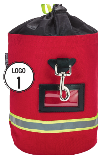
BACK - 5080