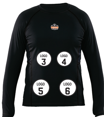
FRONT - 6435

Digital heat transfer your logo to locations 1 and/or 2 (back) and/or locations 3, 4, 5 and 6 (front).