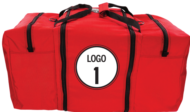
BACK - 5060