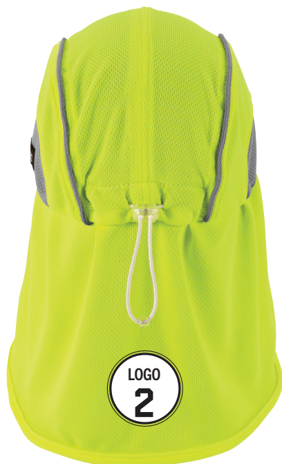
BACK - 6650