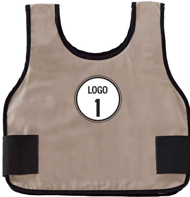
BACK - 6230

Digital heat transfer your logo to location 1 (back) and/or location 2 (front).