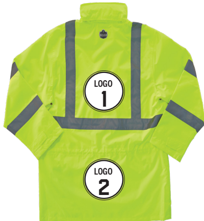
BACK - 8365

Digital heat transfer your logo to locations 1 and/or 2 (back) and/or locations 3, 4, 5 and 6 (front).