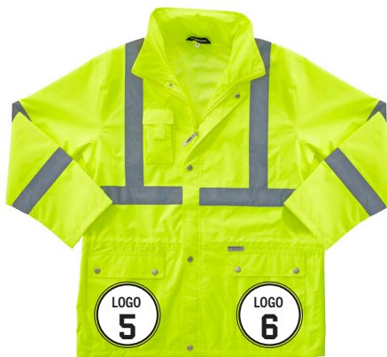
FRONT - 8365