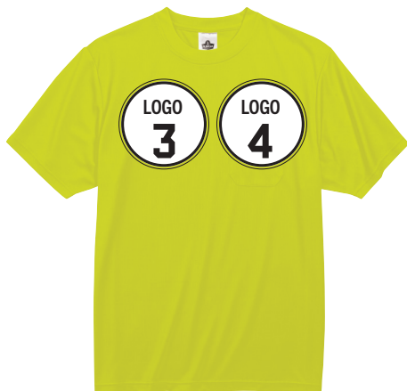
FRONT - 8089

Digital heat transfer your logo to location 2 (back) and/or locations 3 & 4 (front).