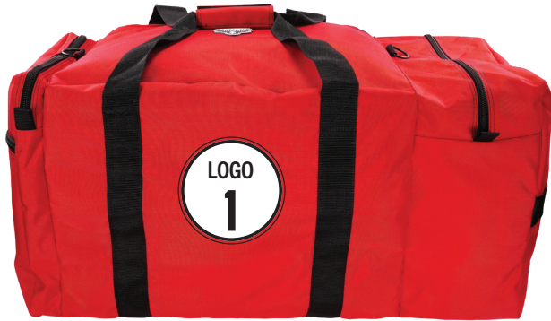
BACK - 5005

Digital heat transfer your logo to location 1 (back or sides) and/or location 2 (pocket end).