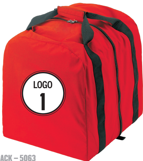
BACK - 5063

Digital heat transfer your logo to location 1 (back or side).