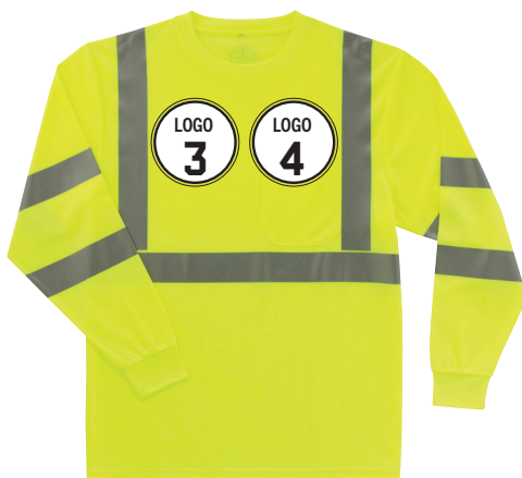
FRONT - 8391