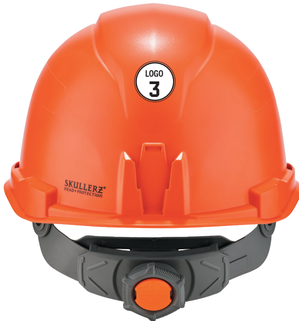
BACK – 8970