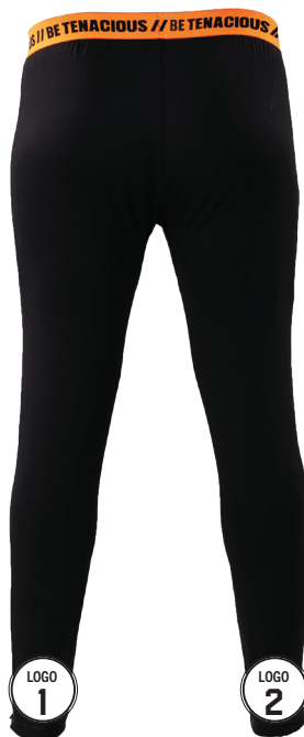
BACK - 6480