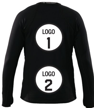
BACK - 6435