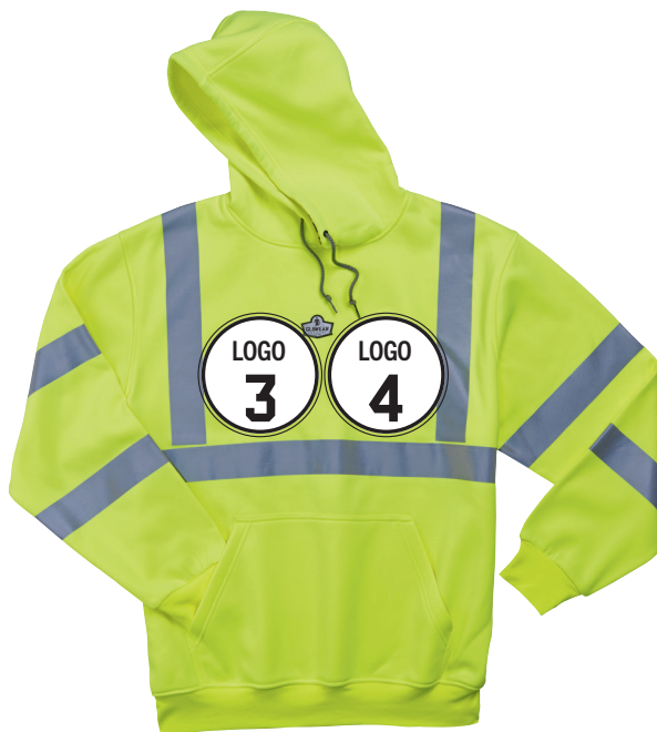
FRONT - 8393

Digital heat transfer your logo to locations 1 and/or 2 (back) and/or locations 3 & 4 (front).