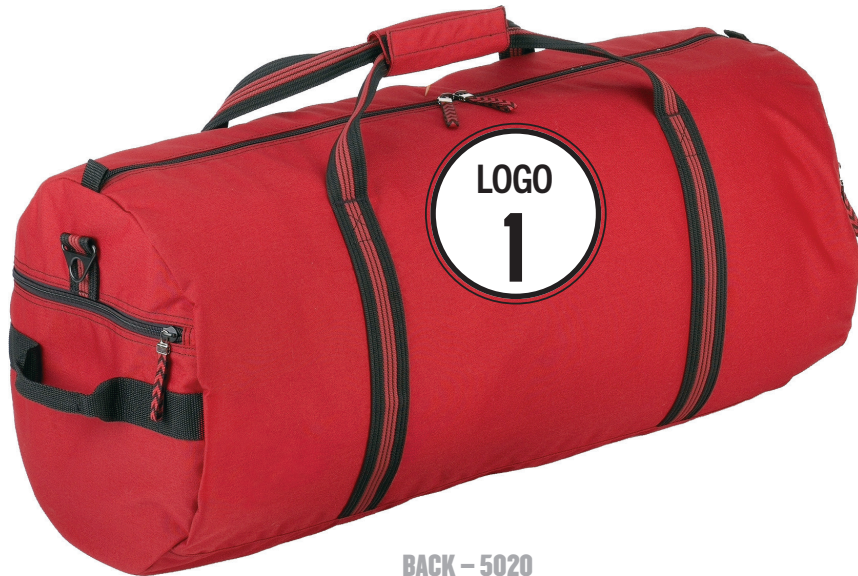
BACK - 5020

Digital heat transfer your logo to location 1 (back).