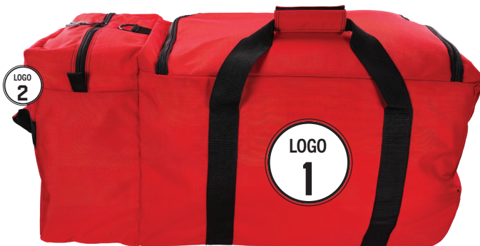
BACK - 5005W