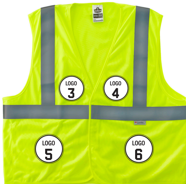
FRONT - 8255HL