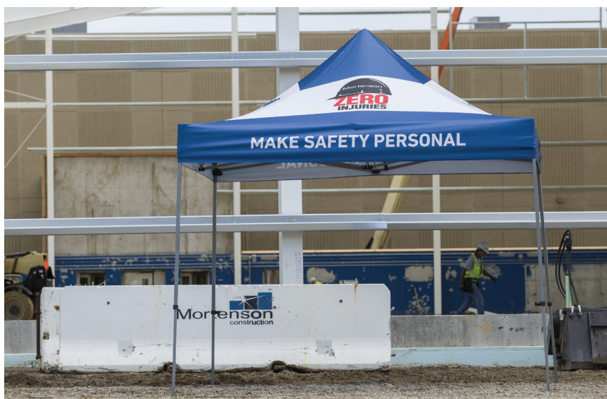
6005 CUSTOM SUBLIMATED TENT

Black or white only. MAX of 25 tents. No pallet discount.