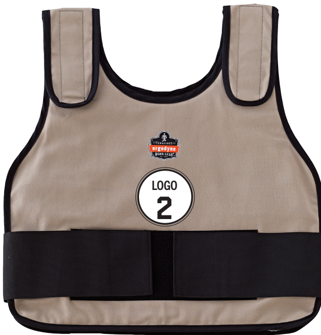
FRONT - 6230