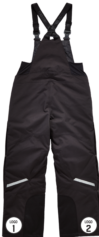
BACK - 6471