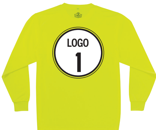
BACK - 8091