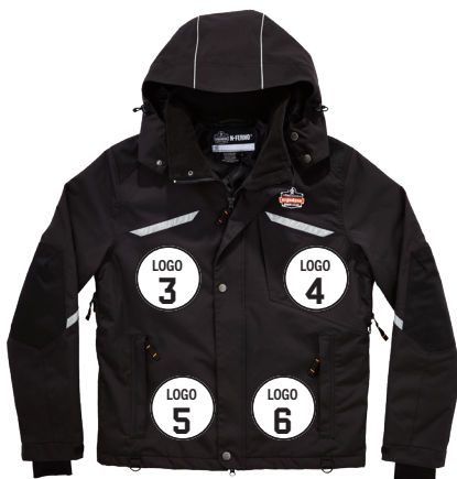
FRONT - 6466

Digital heat transfer your logo to locations 1 and/or 2 (back) and/or locations 3, 4, 5 and 6 (front).